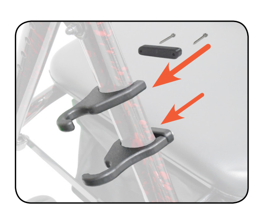
Attach 1 mounting bracket with 2 screws to upper arm and tighten. Repeat for lower arm.