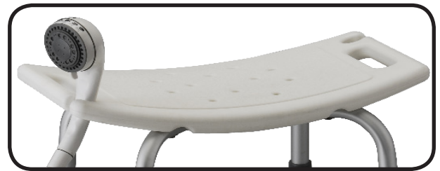
Hand Held Shower Set not included

NOTE: Use both hands to hold onto the side handles to ensure stability of the bath bench. Using only one hand on either side can topple the bench.